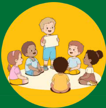
Talking and listening