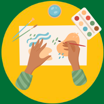
Painting, drawing, cutting and pasting

Each day, children are exposed to a range of inviting activities to foster different learning styles, interests and strengths.