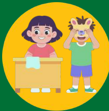
Dressing up and imaginative play