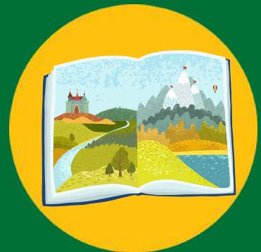
Exploring books, listening to stories and storytelling