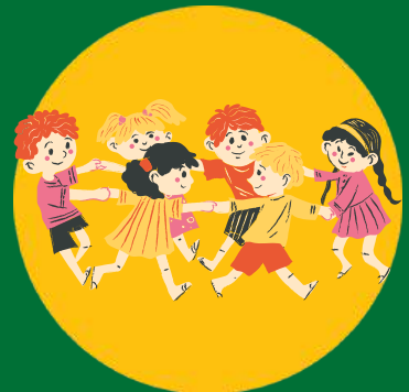
Opportunities to share with other children and develop independence