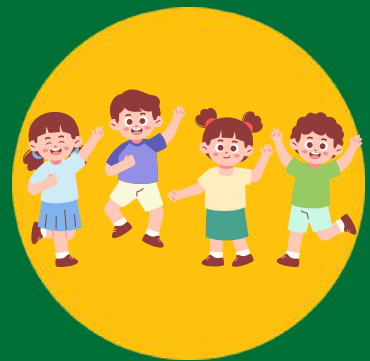
Singing, dancing to and playing music