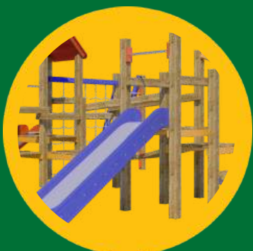
Climbing, balancing, running and jumping