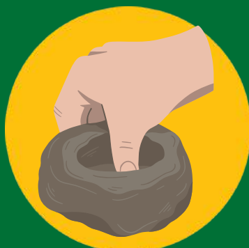
Playing with clay, play dough, sand and water